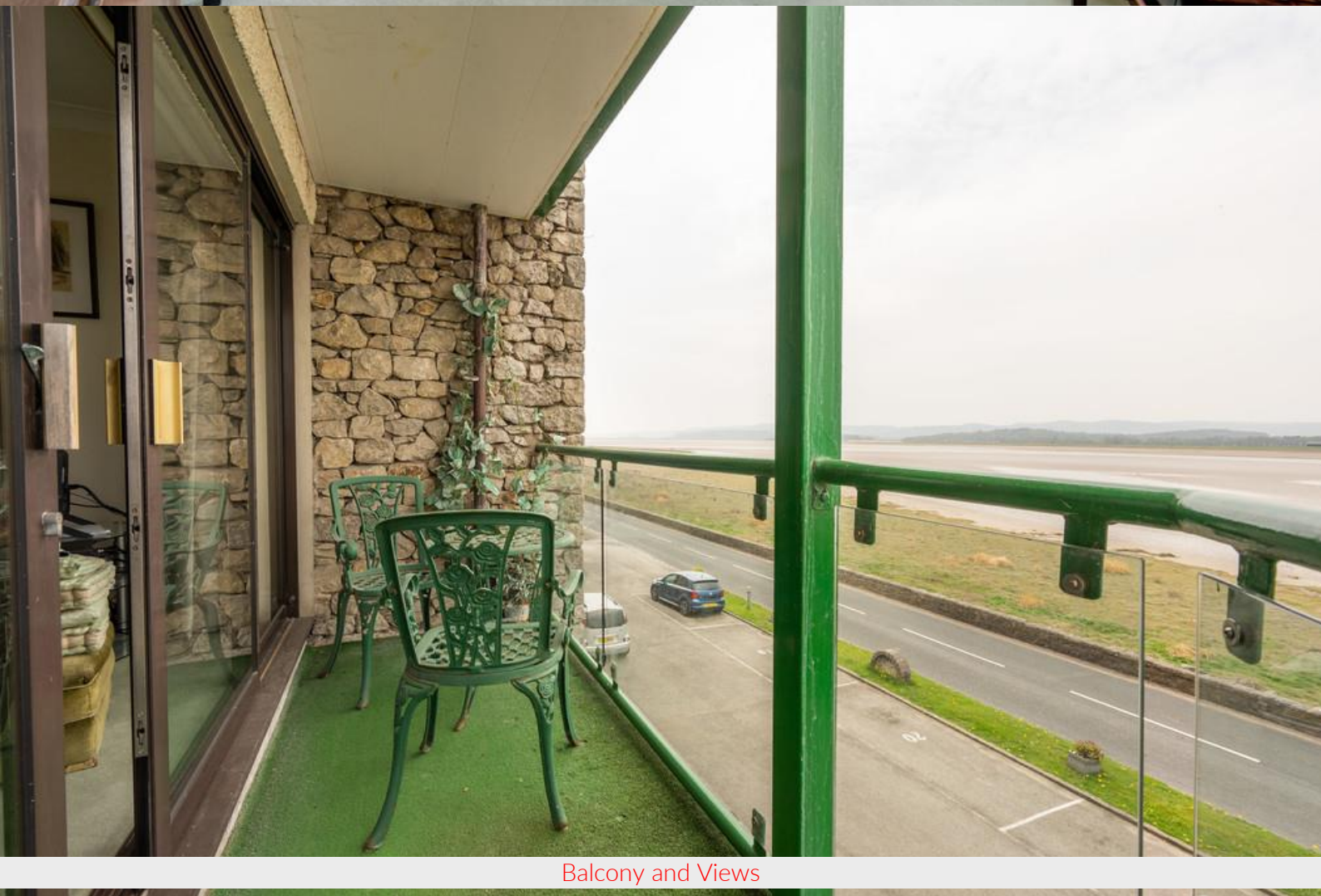
Balcony and Views