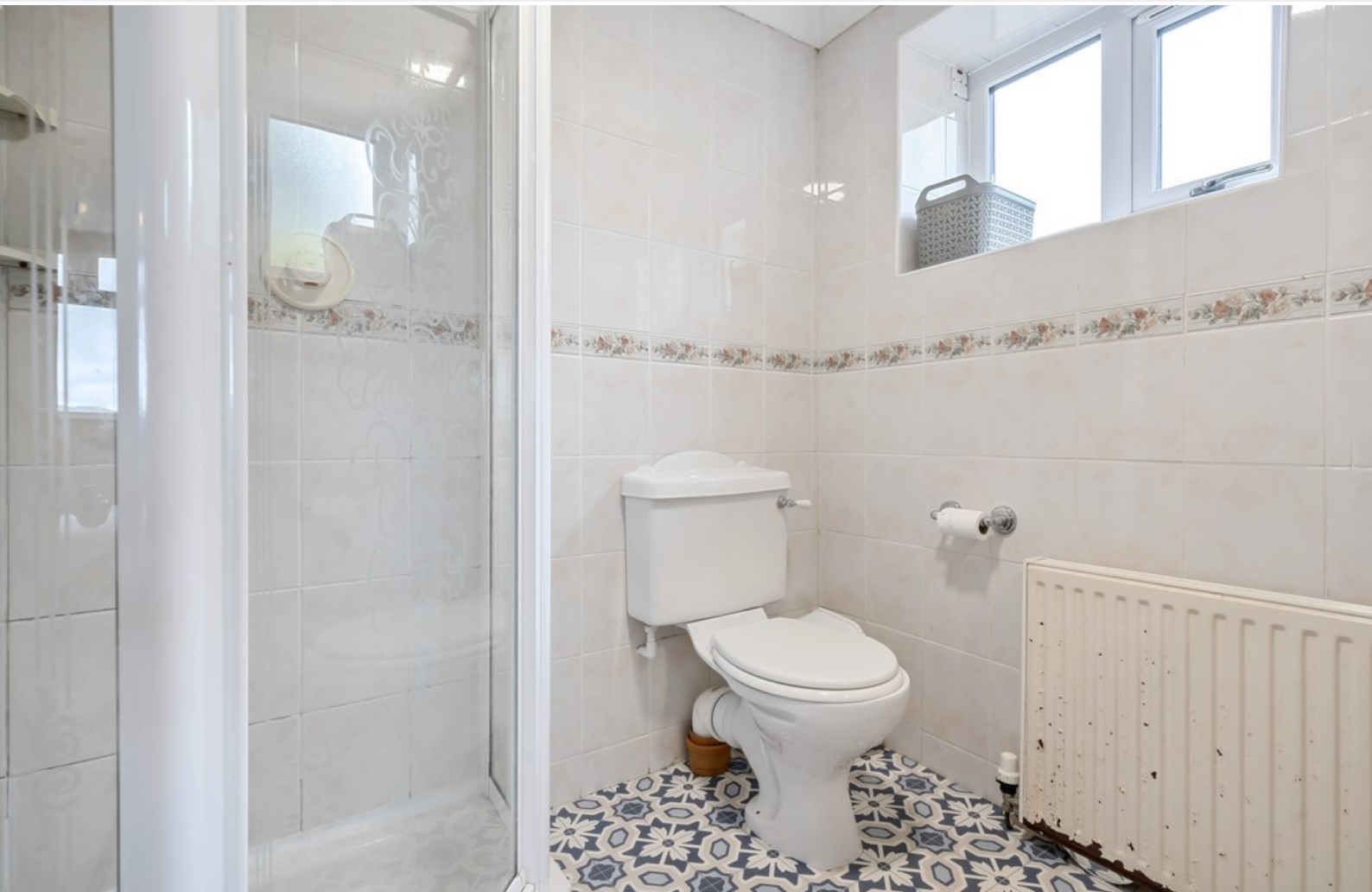
En Suite Shower Room