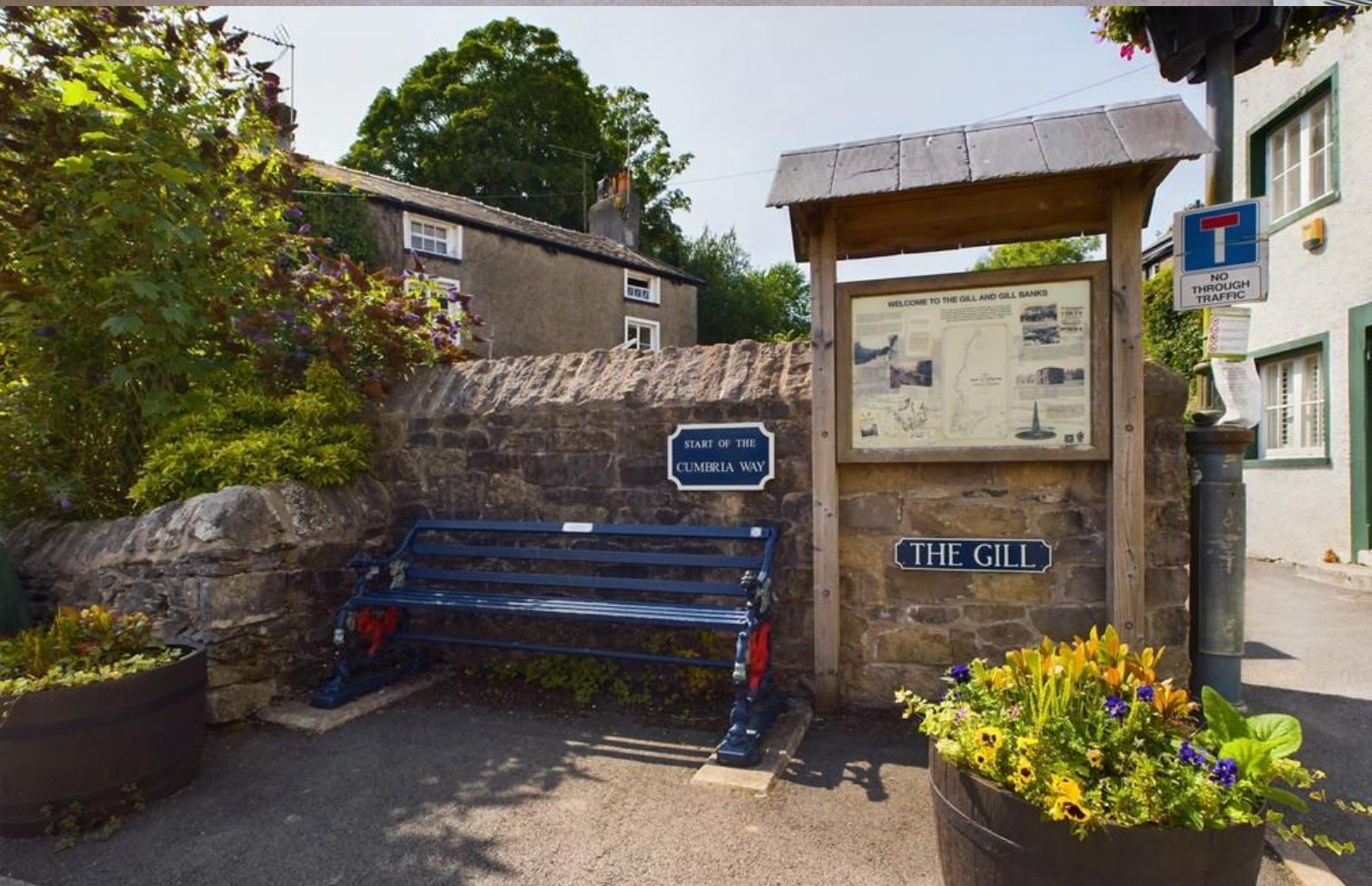
Start of The Cumbrian Way