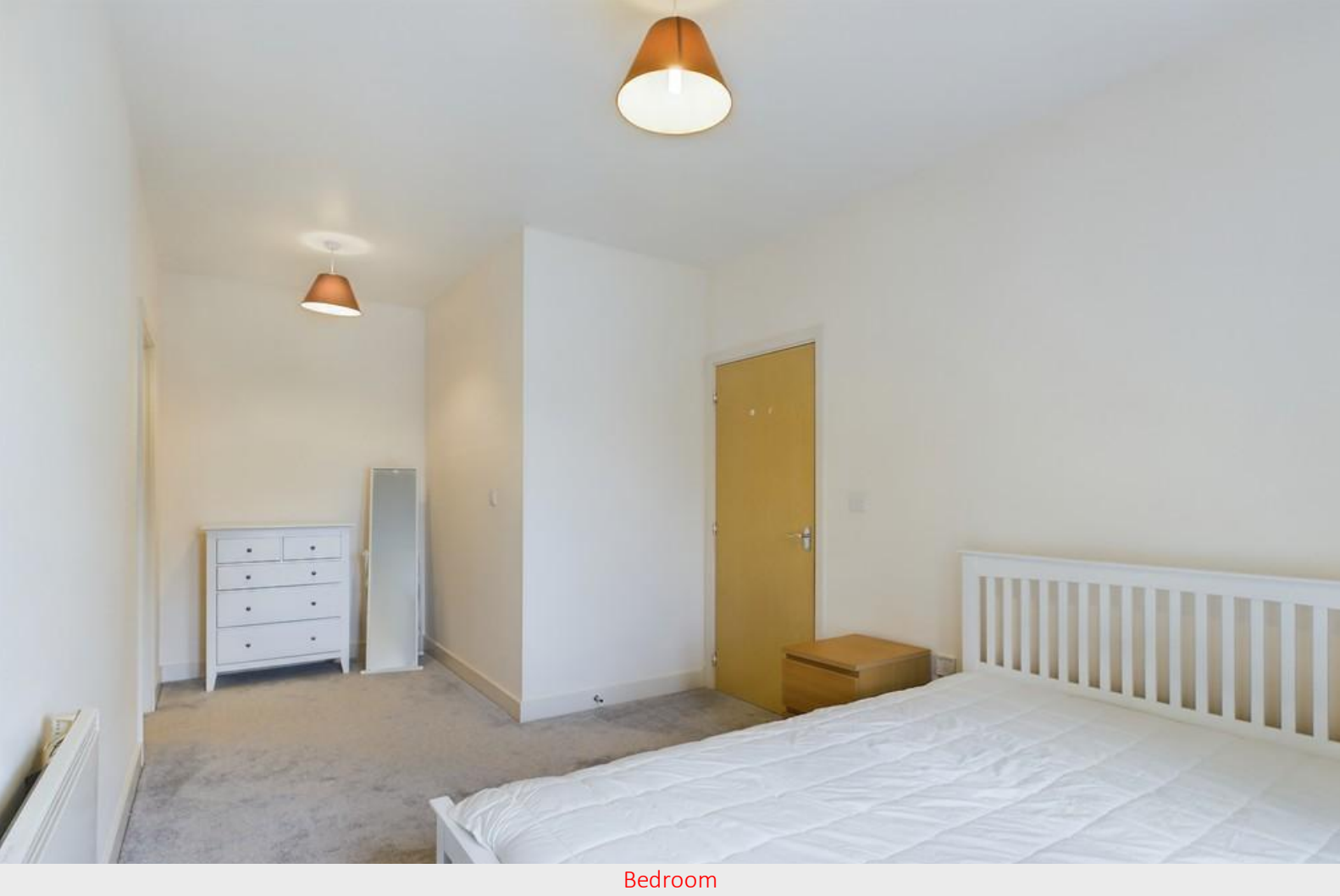
www. hackney-leigh .co.uk