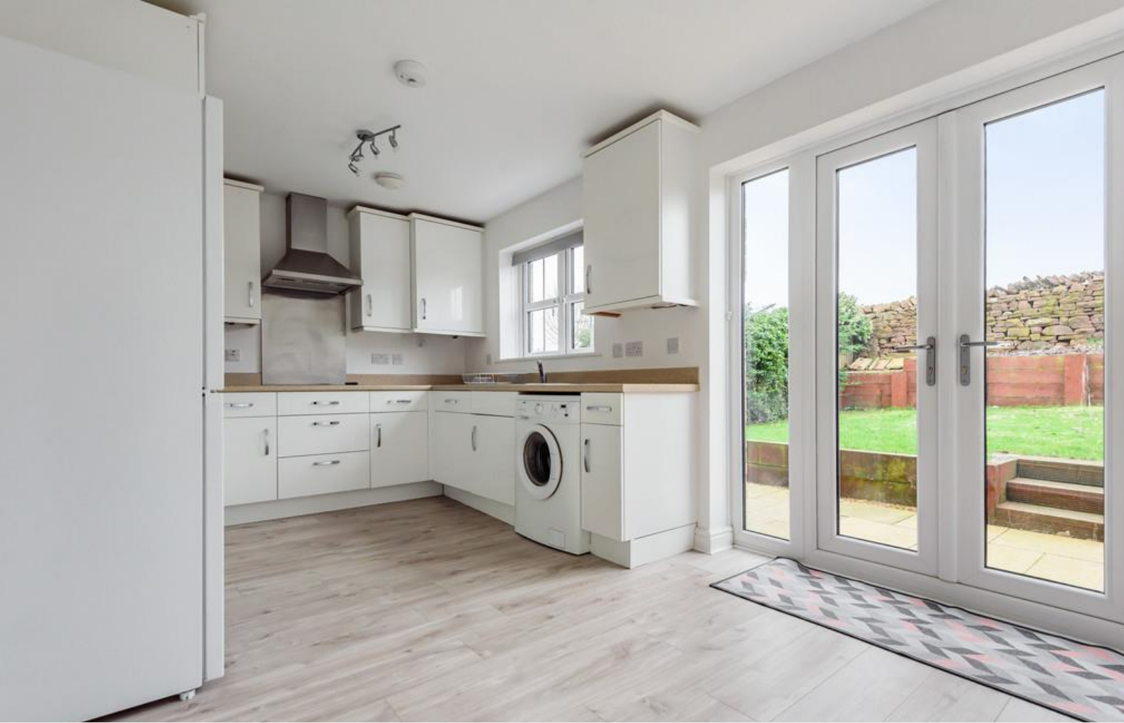
Kitchen Dining Room