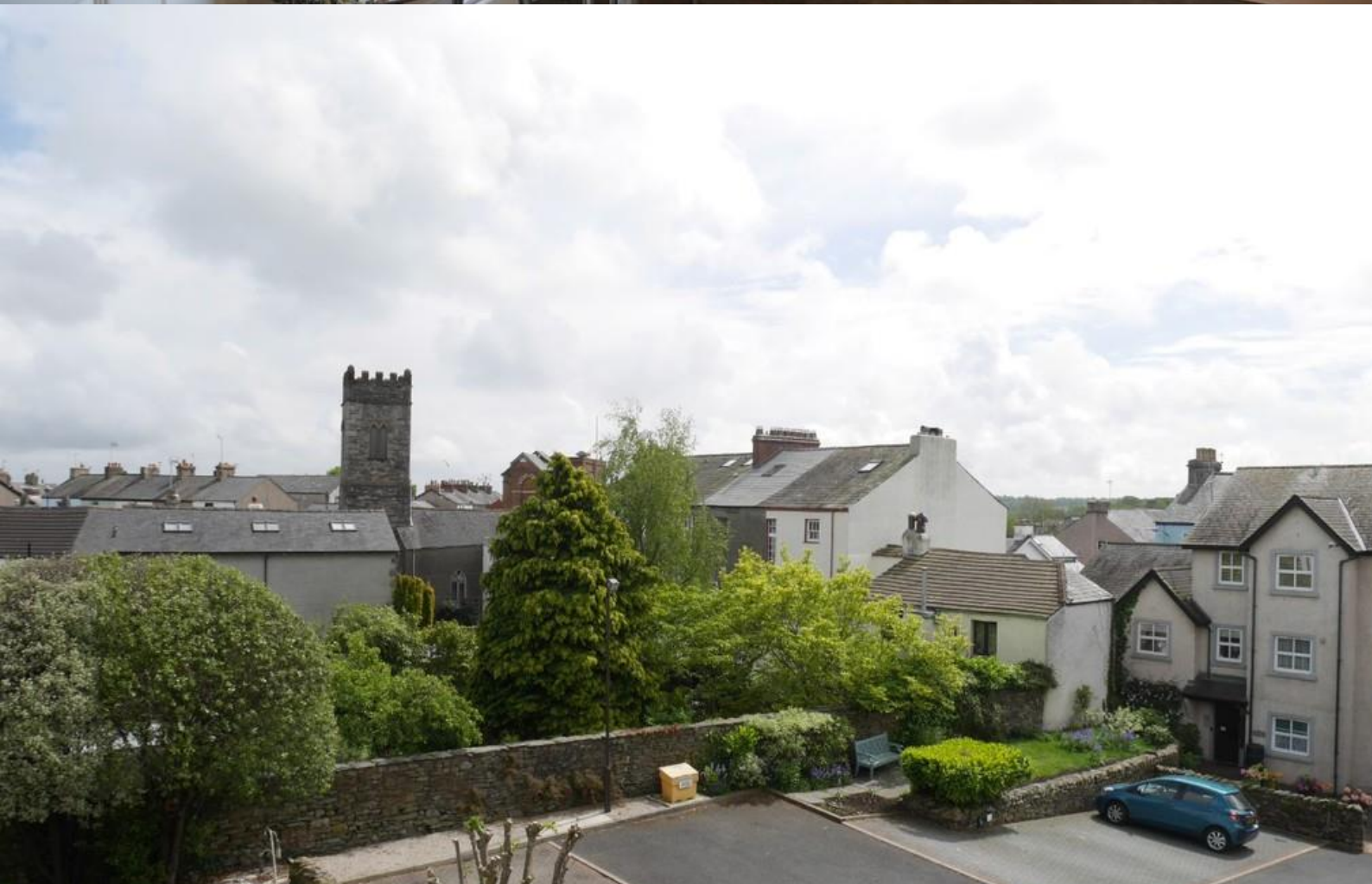
View from Apartment