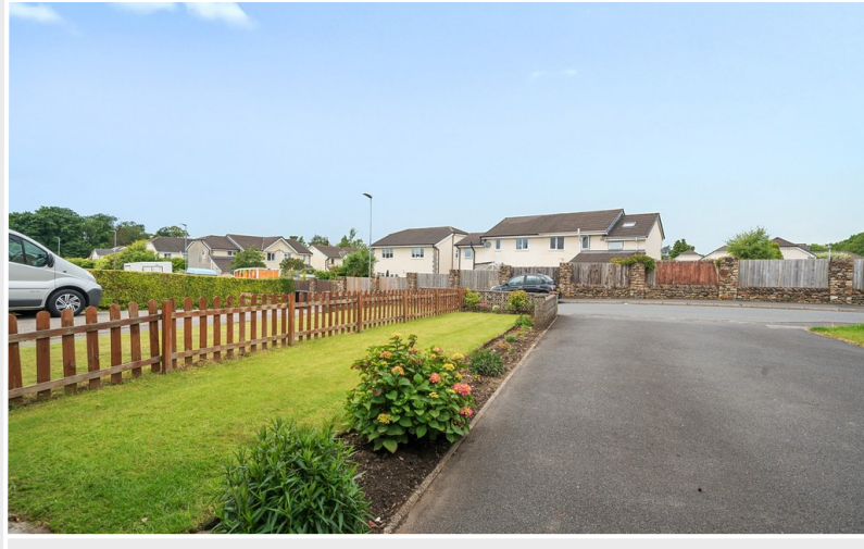
Front garden and driveway