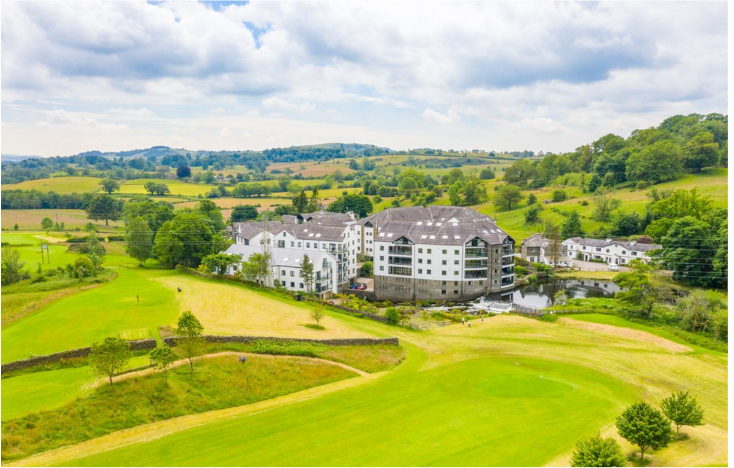
Golf Course & The Estate