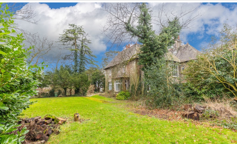
Gardens and grounds