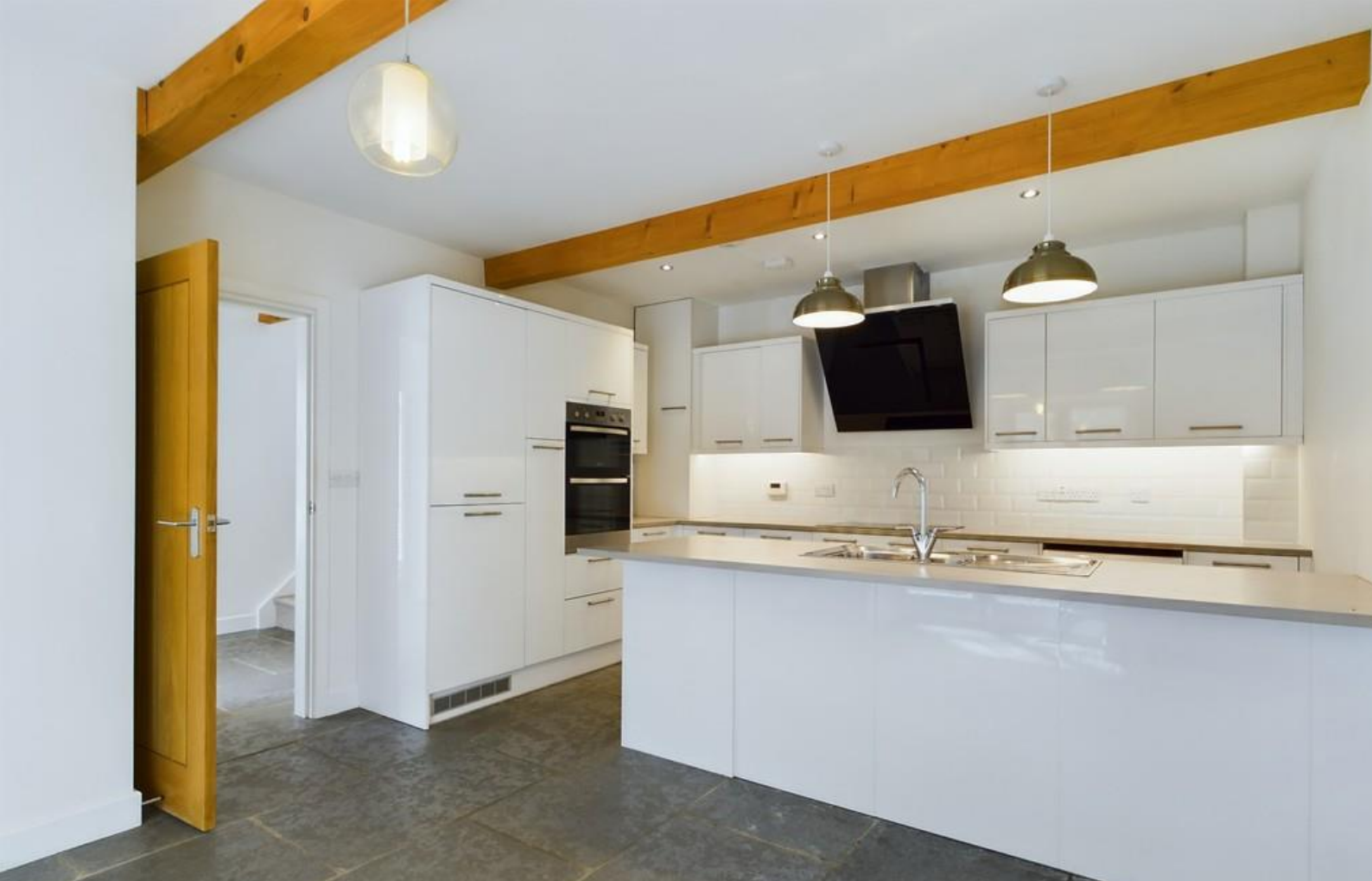
Kitchen Dining Room