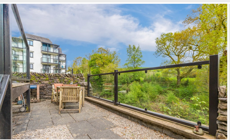
Rear Enclosed Terrace