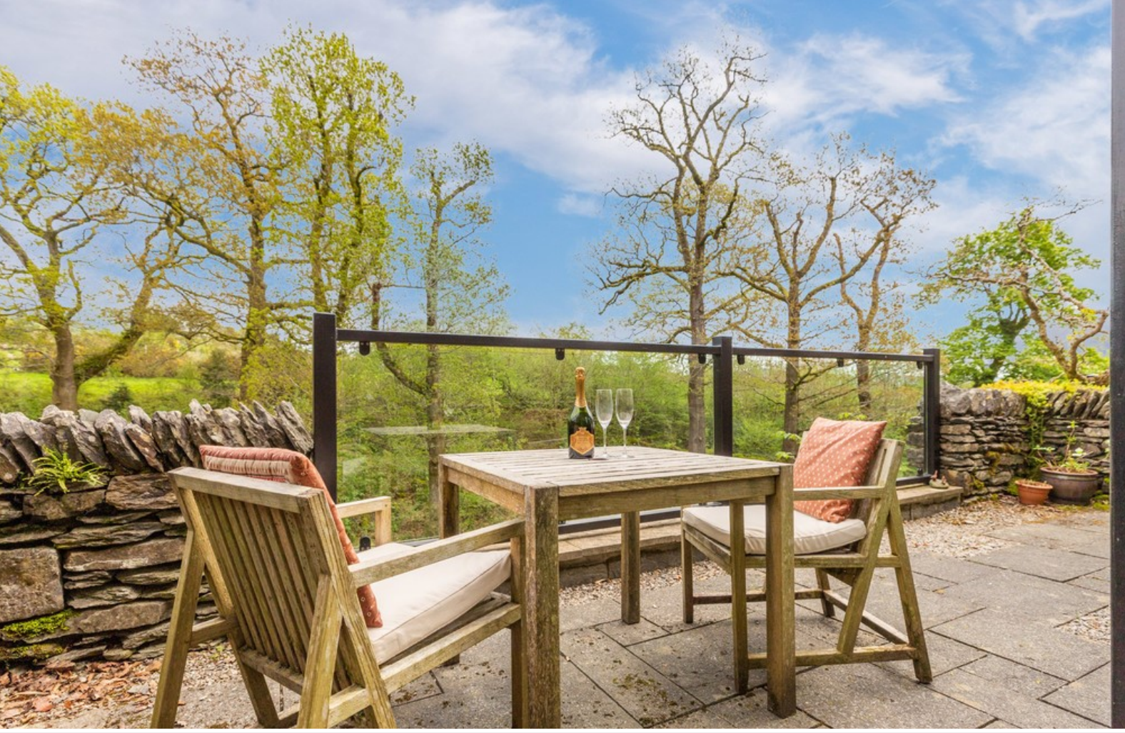
Rear Enclosed Terrace