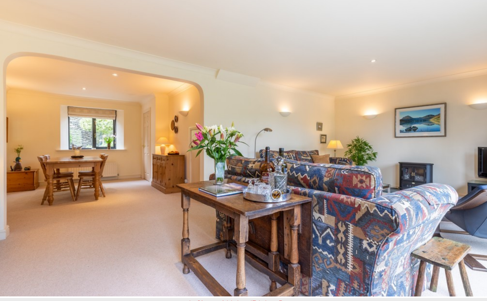
L-Shaped Living/Dining Room