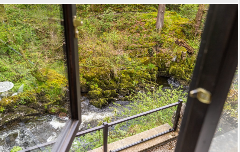
View from Bedroom One

Upstairs on the landing there is access to the loft space via a hatch. There is an airing cupboard housing the hot water cylinder with wooden shelves, perfect for linen.