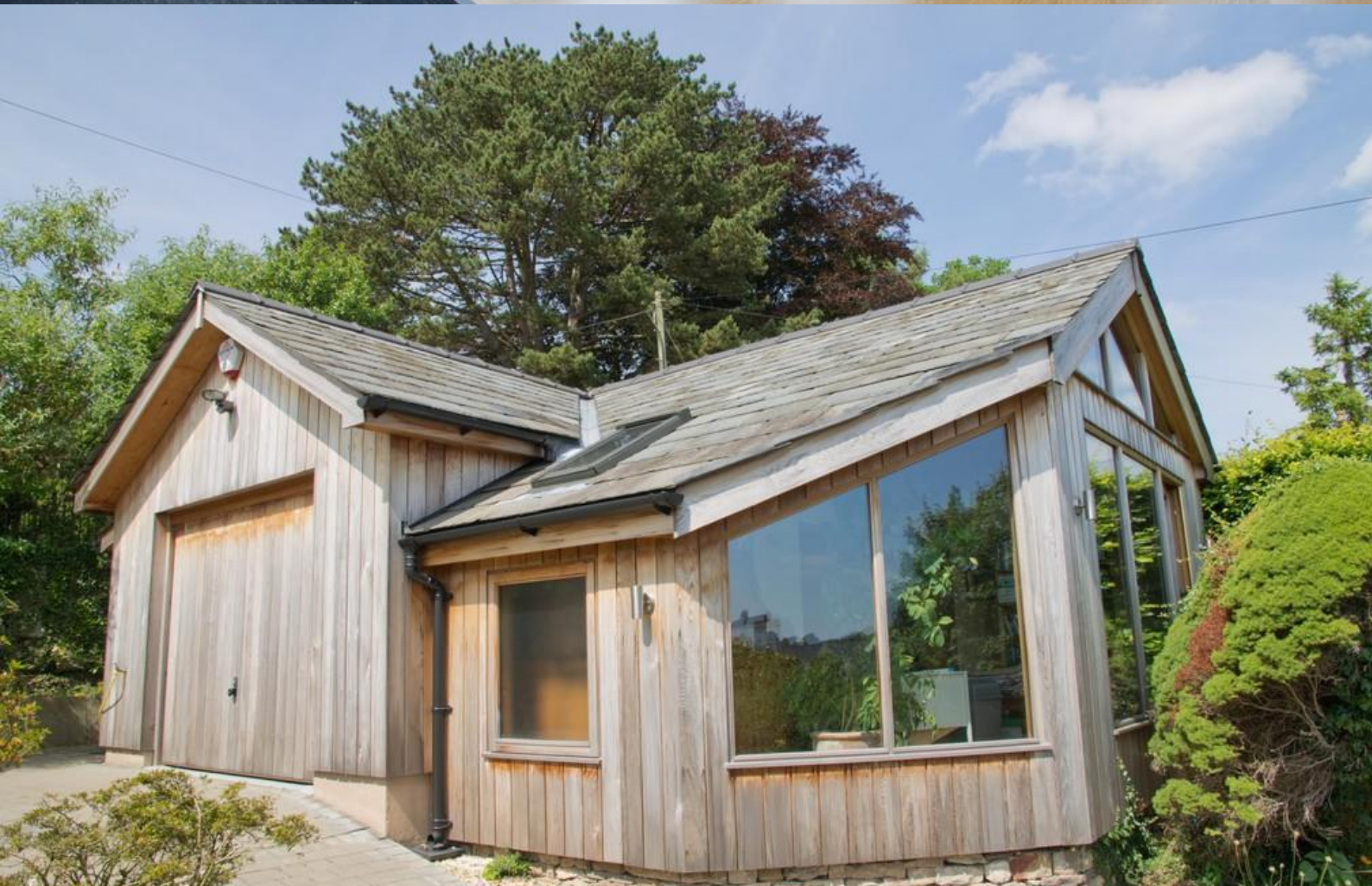
Design Studio and Garage