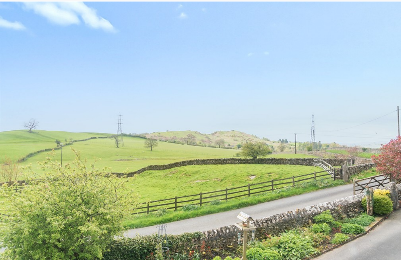
Views of The Helm