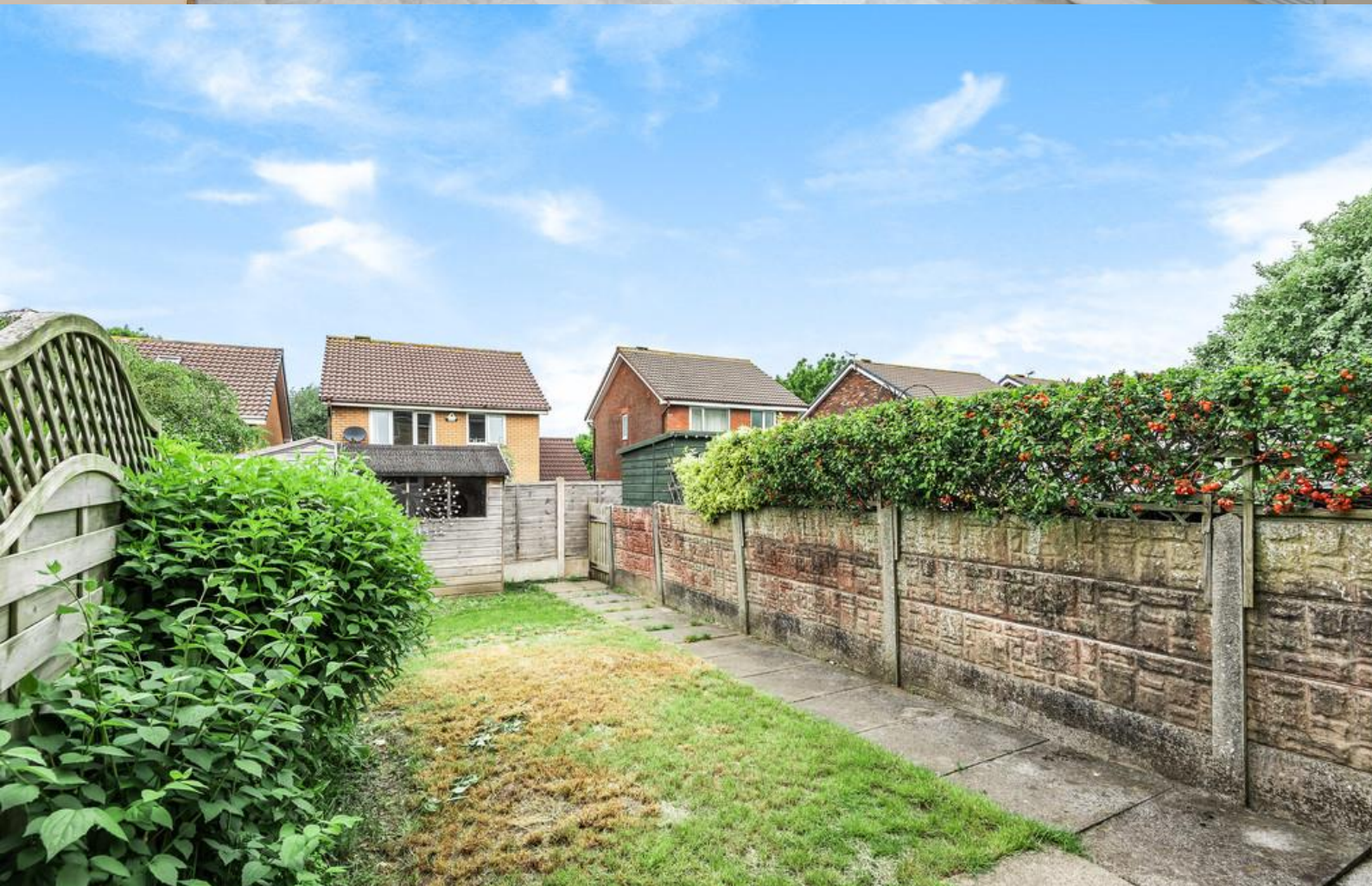
Rear Garden and Shed