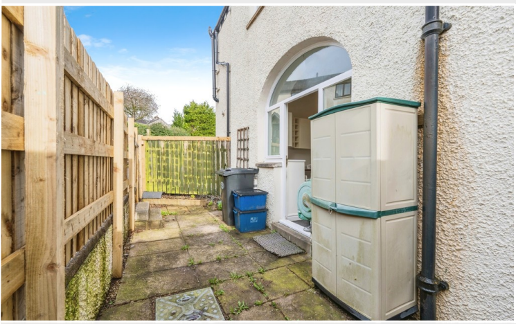
Enclosed private patio