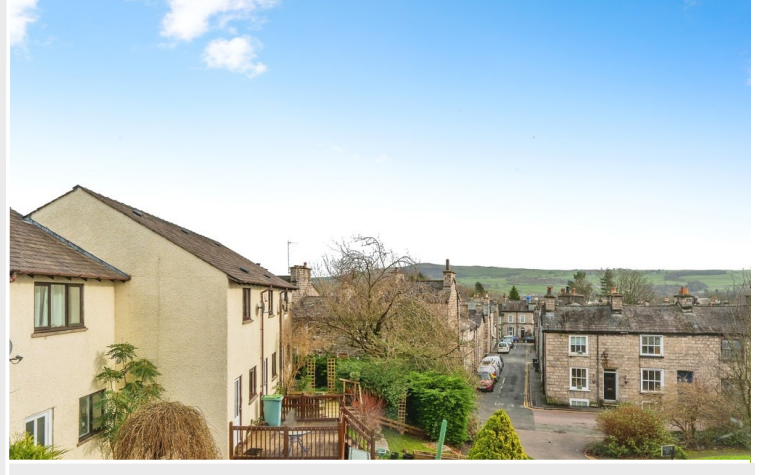
Views across to Benson Knott