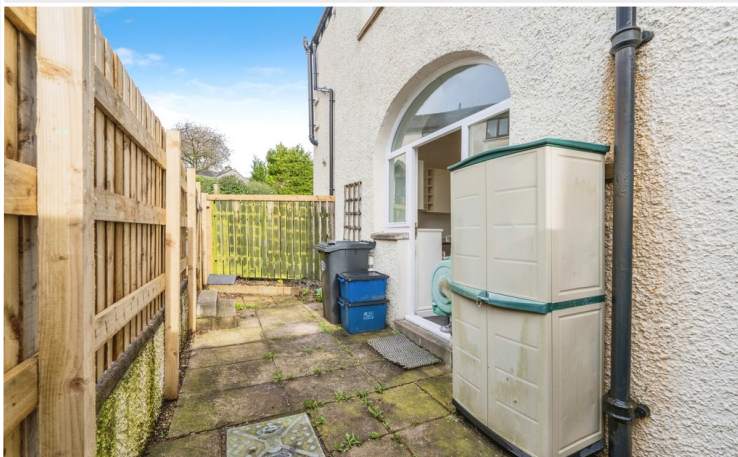
Enclosed private patio