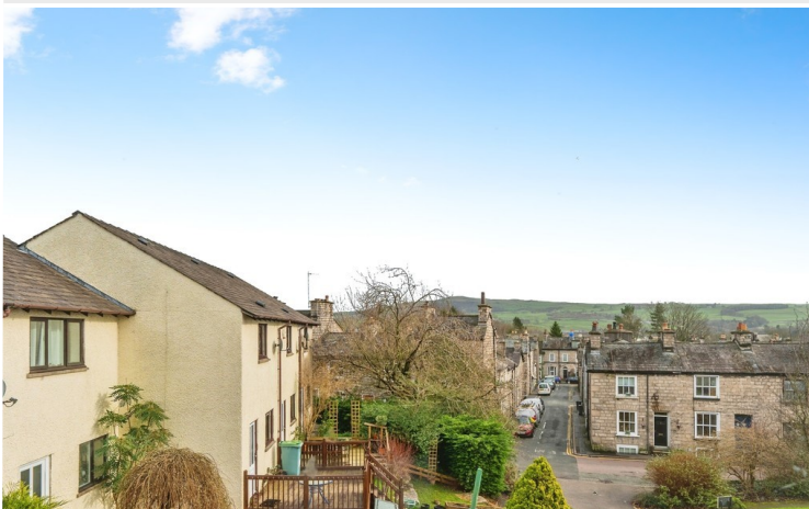
Views across to Benson Knott