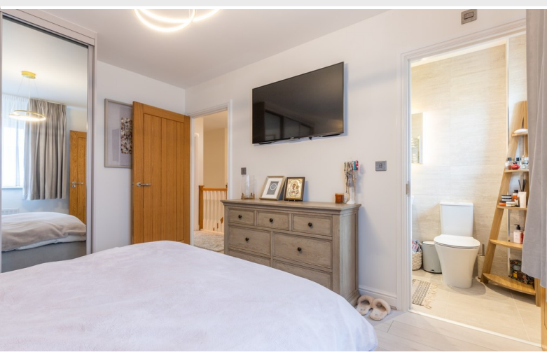
Bedroom 2 with En-suite

Outside, you'll find a good-sized rear lawned garden, ideal for outdoor entertaining or simply enjoying the sunshine. The property also boasts a garage and off-road parking, complete with an external electric charging point for your convenience.