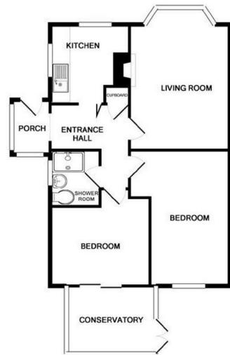
32, LEAZE CLOSE, BERKELEY, GL13 9DA TOTAL APPROX. FLOOR AREA 699 SQ.FT. (64.9 SQ.M.) Whilst every effort has been made to ensure the accuracy of the floor plan contained here, measurements of doors, windows, rooms and any other items are approximate and no responsibility is taken for any error, omission, or misstatement. This plan is for illustrative purposes only and should be used as such by any prospective purchaser. The services, systems and appliances shown have not been tested and no guarantee as to their operability or efficiency can be given. Made with Metropix ©2014