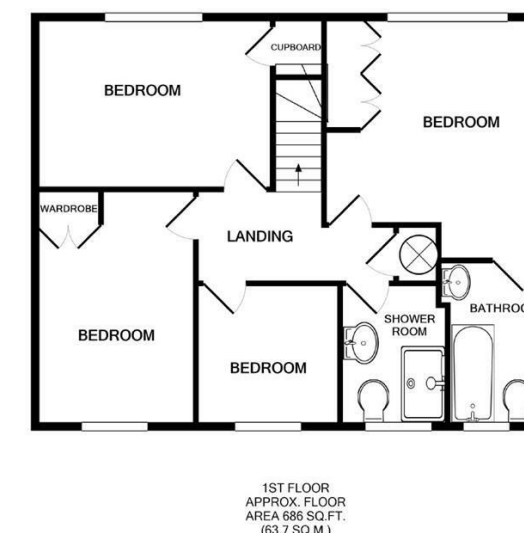
3 ORCHARD CLOSE CAM DURSLEY GL11 5PU. TOTAL APPROX. FLOOR AREA 1696 SQ.FT. (157.6 SQ.M.) Whilst every attempt has been made to ensure the accuracy of the floor plan contained here, measurements of doors, windows, rooms and any other items are approximate and no responsibility is taken for any error, omission, or mis-statement. This plan is for illustrative purposes only and should be used as such by any prospective purchaser. The services, systems and appliances shown have not been tested and no guarantee as to their operability or efficiency can be given. Made with Metropix ©2020.