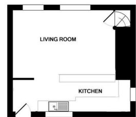
GROUND FLOOR APPROX. FLOOR AREA 312 SQ. FT. (29.0 SQ.M.)