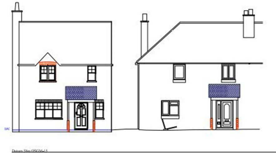
Proposed North Western Elevation

We offer property for sale by immediate, unconditional contract. This means that the fall of the electronic gavel constitutes an exchange of contracts between the buyer and seller. Both parties are legally bound to complete the transaction usually within 20 working days following the close of the auction but this will be confirmed within the legal documentation.