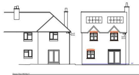
Proposed South Eastern Elevation