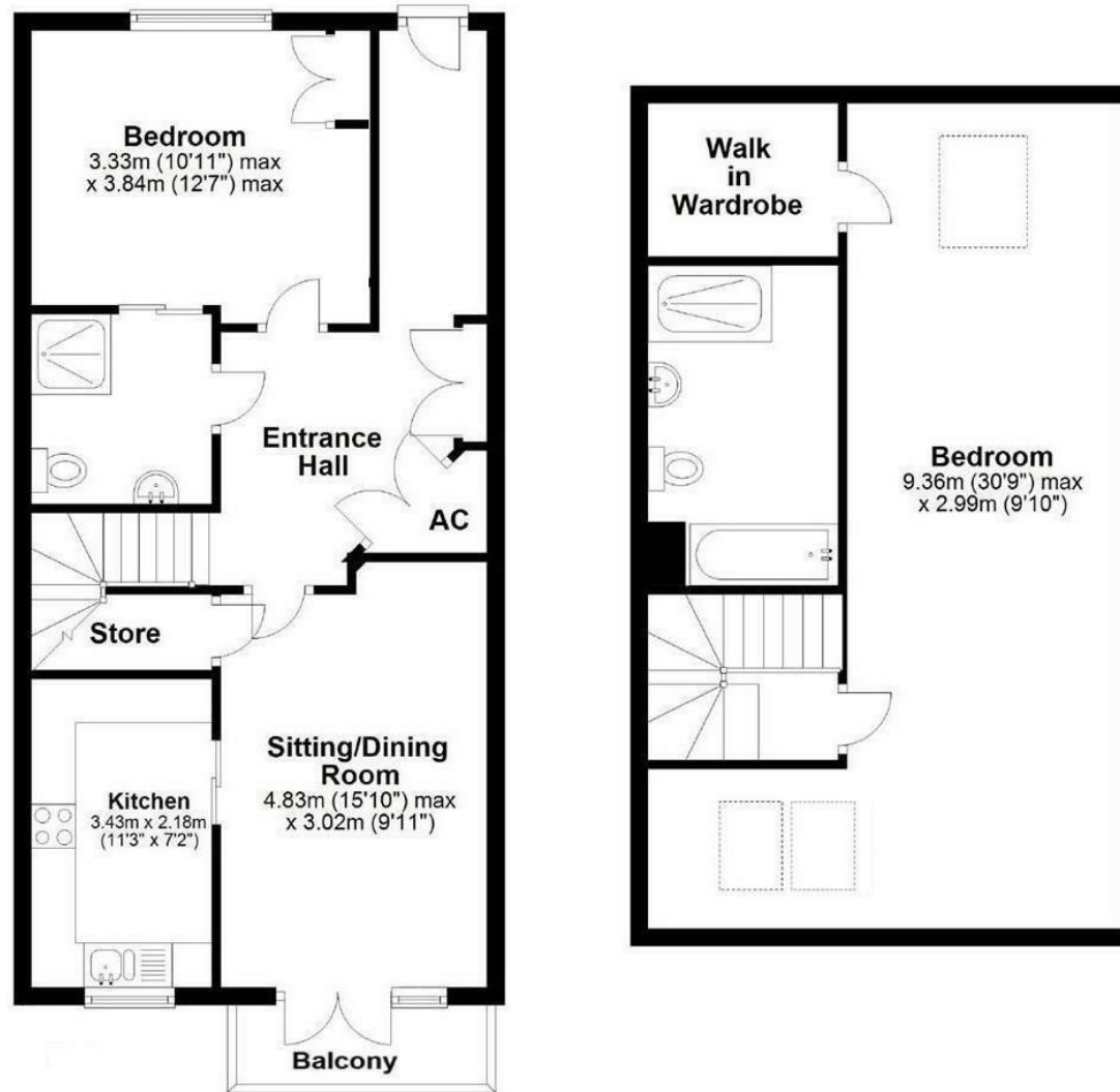
Illustration for identification purposes only, measurements are approximate, not to scale. Plan produced using PlanUp.

Disclaimer These particulars, whilst believed to be accurate are set out as a general outline only for guidance and do not constitute any part of an offer or contract. Intending purchasers should not rely on them as statements of representation of fact, but must satisfy themselves by inspection or otherwise as to their accuracy. No person in this firm's employment has the authority to make or give any representation or warranty in respect of the property. All measurements and distances are approximate only. Your home is at risk if you do not keep up repayments on a mortgage or other loan secured on it.