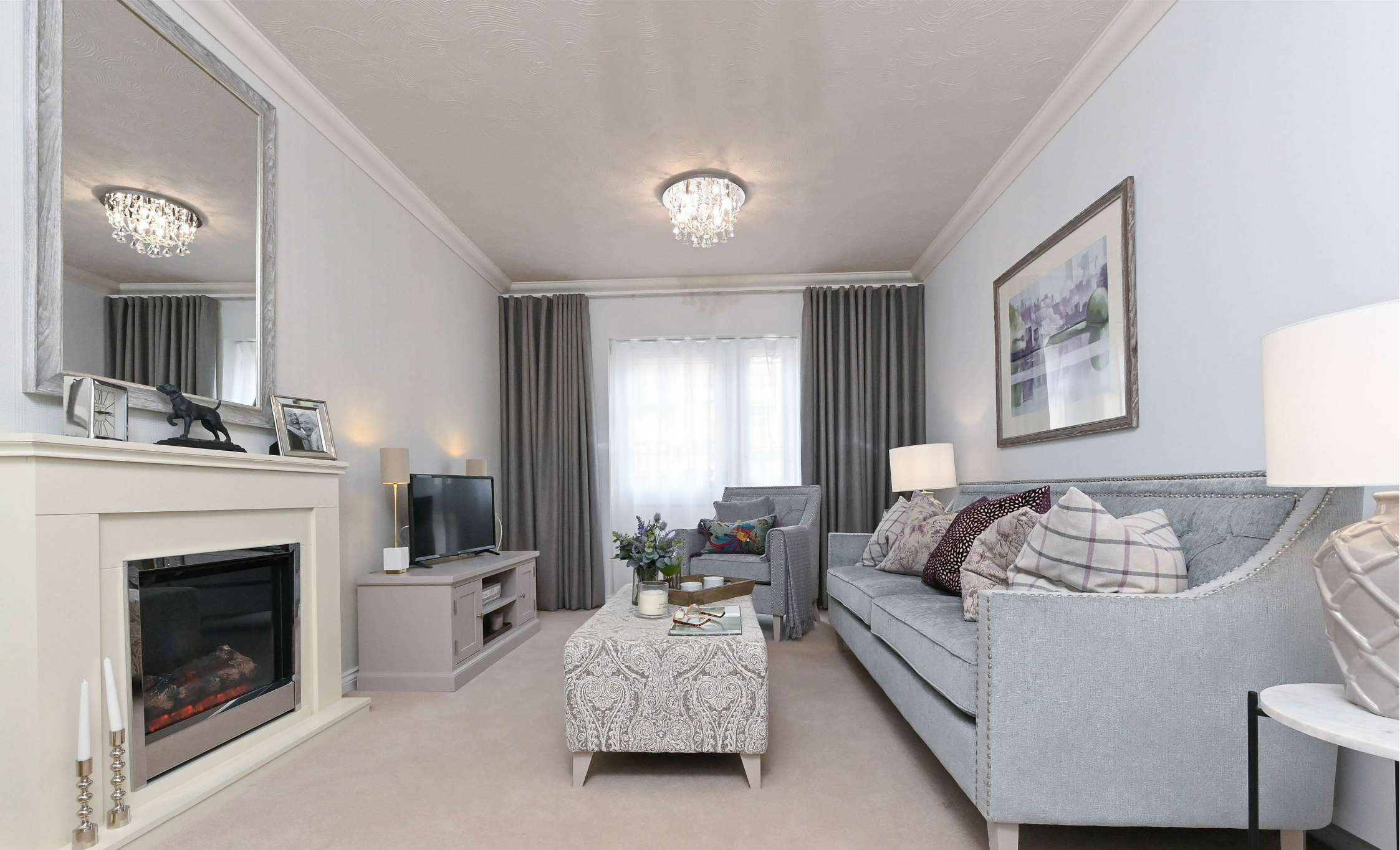
St Andrew's Lodge, The Causeway Chippenham, SN15 3HN