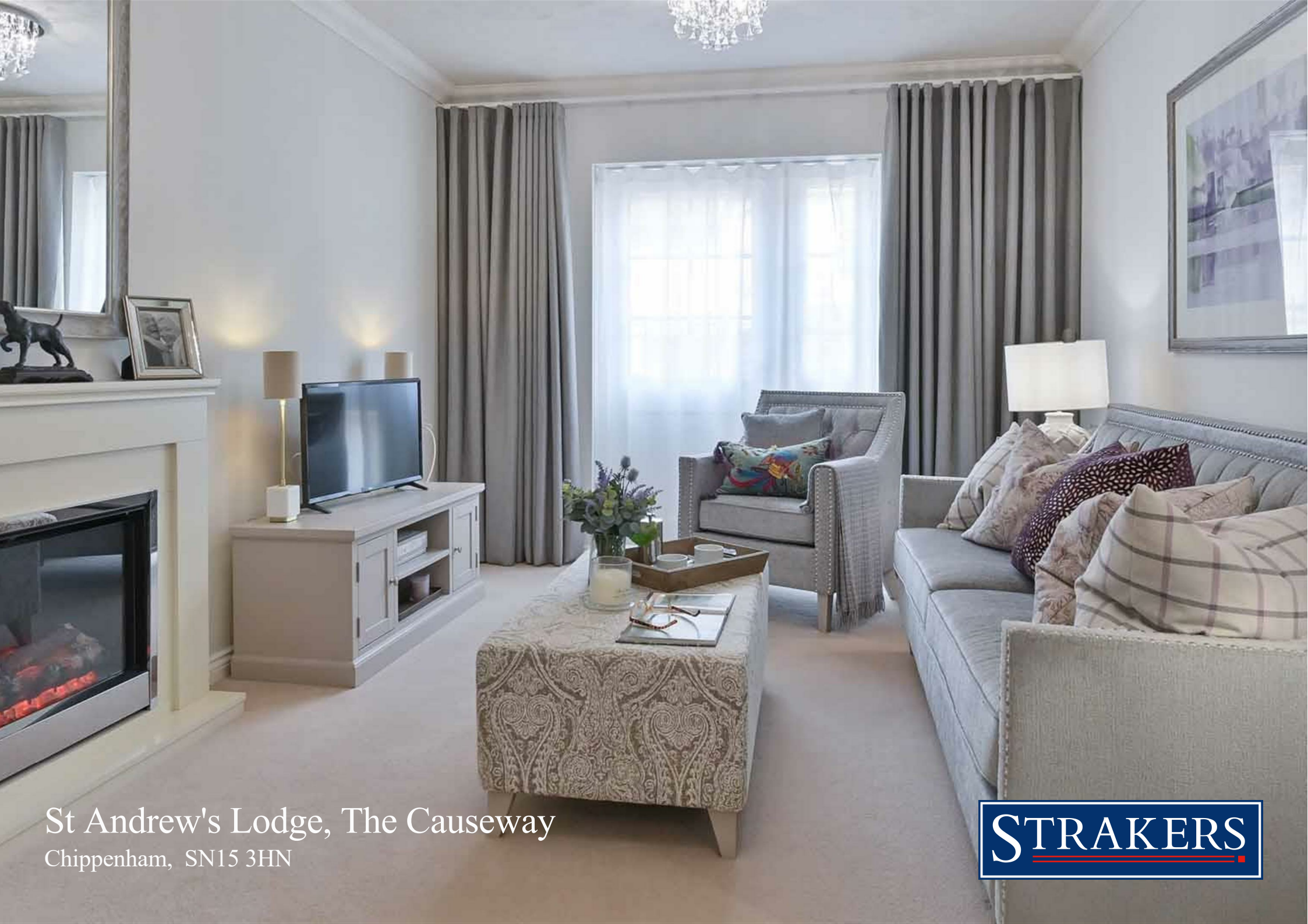
St Andrew's Lodge, The Causeway Chippenham, SN15 3HN