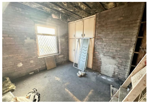
32 Emscote Grove, Halifax, HX1 3AP