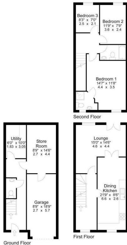
For illustrative purposes only. Not to scale.

Approx Gross Floor Area = 1431 Sq. Feet = 133.0 Sq. Metres