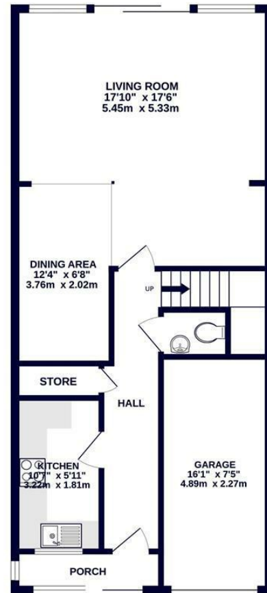
GROUND FLOOR 698 sq.ft. (64.8 sq.m.) approx.