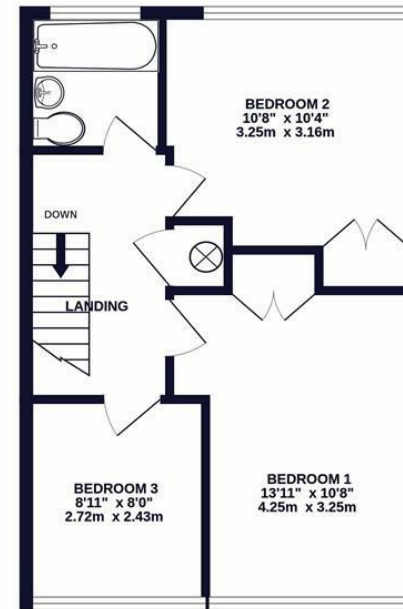
1ST FLOOR 436 sq.ft. (40.5 sq.m.) approx.