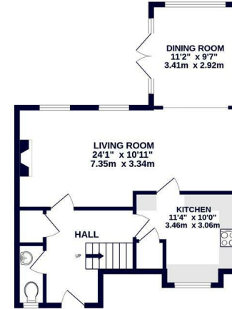
GROUND FLOOR 573 sq.ft. (52.9 sq.m.) approx.