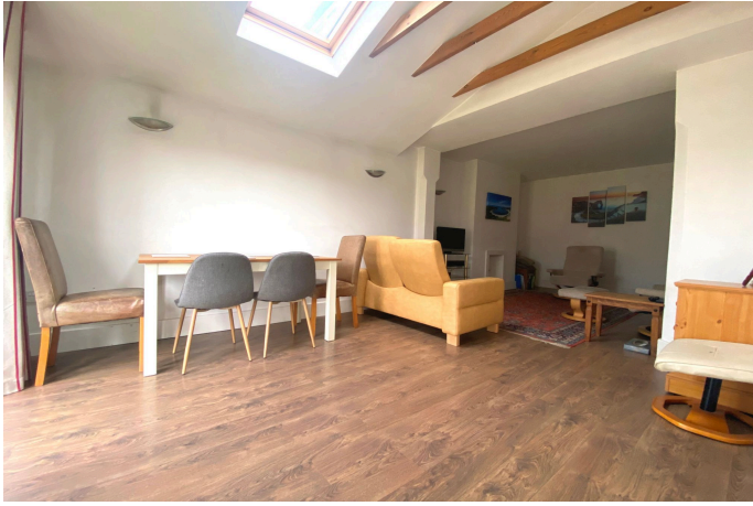
20 Greenfield Road, Spinney Hill, Northampton NN3 2LH £315,000 Freehold