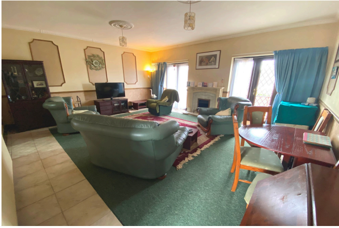
39 Masefield Way, Kingsley, Northampton NN2 7JT £245,000 Freehold