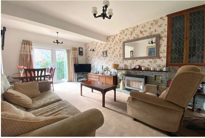
32 Brookland Road, Phippsville, Northampton NN1 4SL £290,000 Freehold