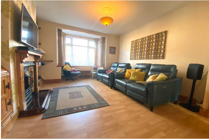
11 Elmhurst Avenue, Spinney Hill, Northampton NN3 2LD £260,000 Freehold