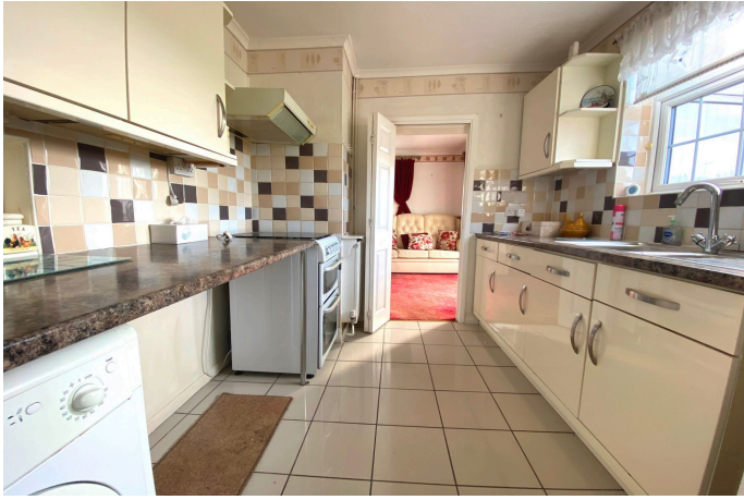
2 Brackenhill Close, Links View, Northampton NN2 7LD £250,000 Freehold