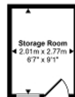
Storage Room Approx 6 sq m / 60 sq ft

This floorplan is only for illustrative purposes and is not to scale. Measurements of rooms, doors, windows, and any items are approximate and no responsibility is taken for any error, omission or mis-statement. Icons of items such as bathroom suites are representations only and may not look like the real items. Made with Made Snappy 300.