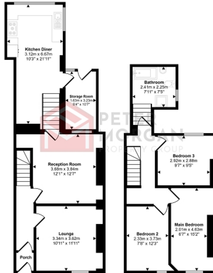
Ground Floor Approx 64 sq m / 684 sq ft

Approx Gross Internal Area 110 sq m / 1180 sq ft