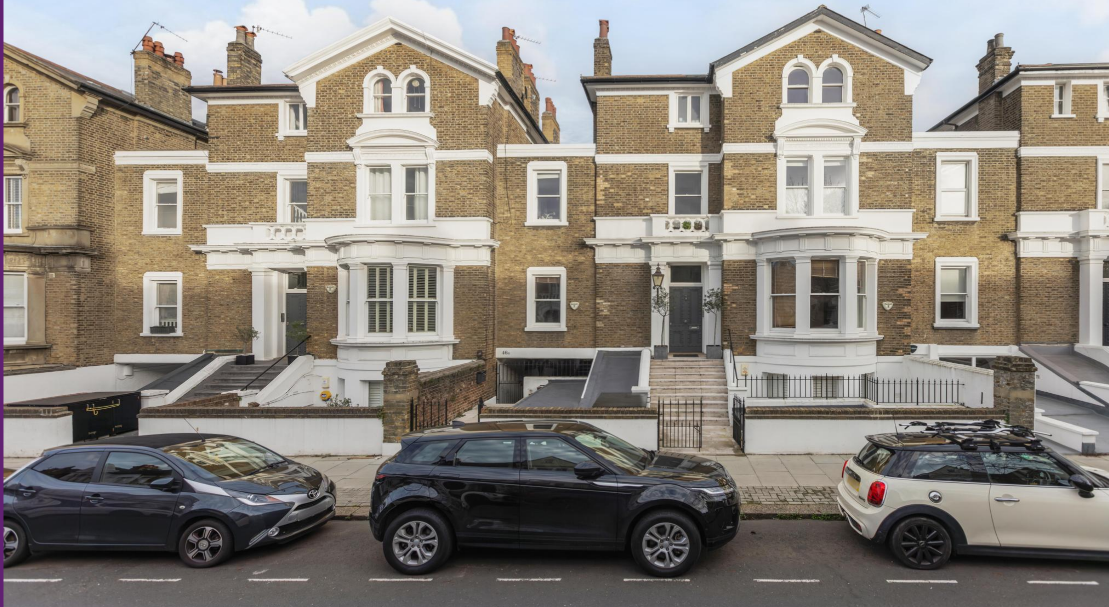
Altenburg Gardens London, SW11