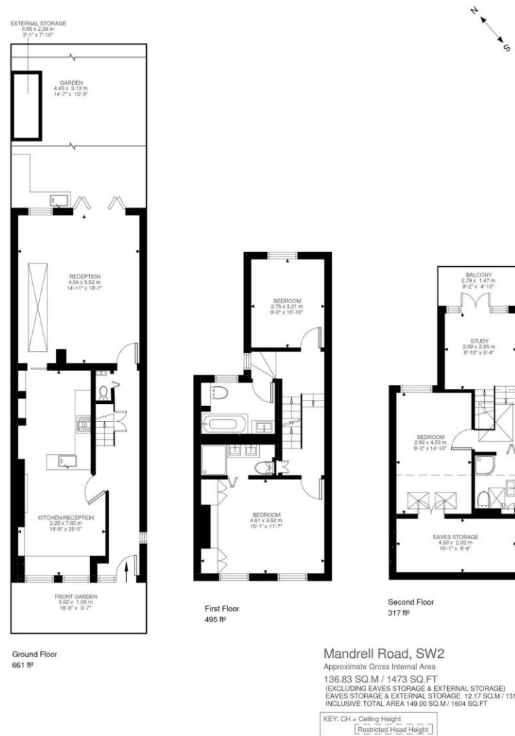
Illustration for identification purposes only. Not to scale. Floor Plan Drawn According To RICS Guidelines.

Chesterton UK Services Limited trading as Chestertons for themselves and for the vendor of this property whose agents they are, give notice that (i) these particulars do not constitute any part of an offer or contract, (ii) all statements contained within these particulars are made without responsibility on the part of Chestertons or the vendor, (iii) whilst made in good faith, none of the statements contained within these particulars are to be relied upon as a statement or representation of fact, (iv) any intending purchasers must satisfy themselves by inspection or otherwise as to the correctness of each of the statements contained within these particulars, (v) the vendor does not make or give either Chestertons or any person in their employment any authority to make or give representation or warranty whatsoever in relation to this property. Wide angle lenses may be used. ©Copyright Chestertons | Chesterton UK Services Limited | Registered Office 40 Connaught Street, Hyde Park, London W2 2AB Registered Company Number 05334580.