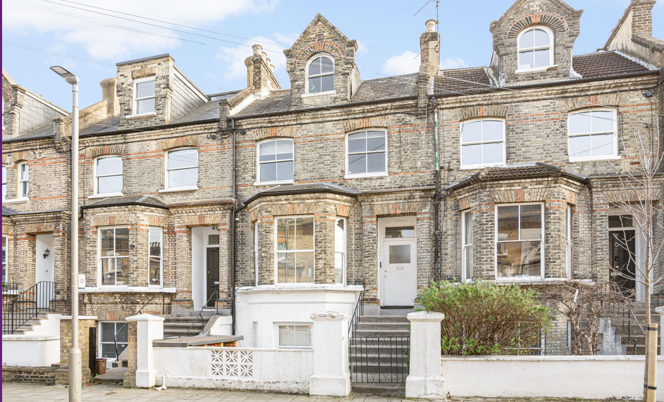
Oberstein Road Battersea, SW11