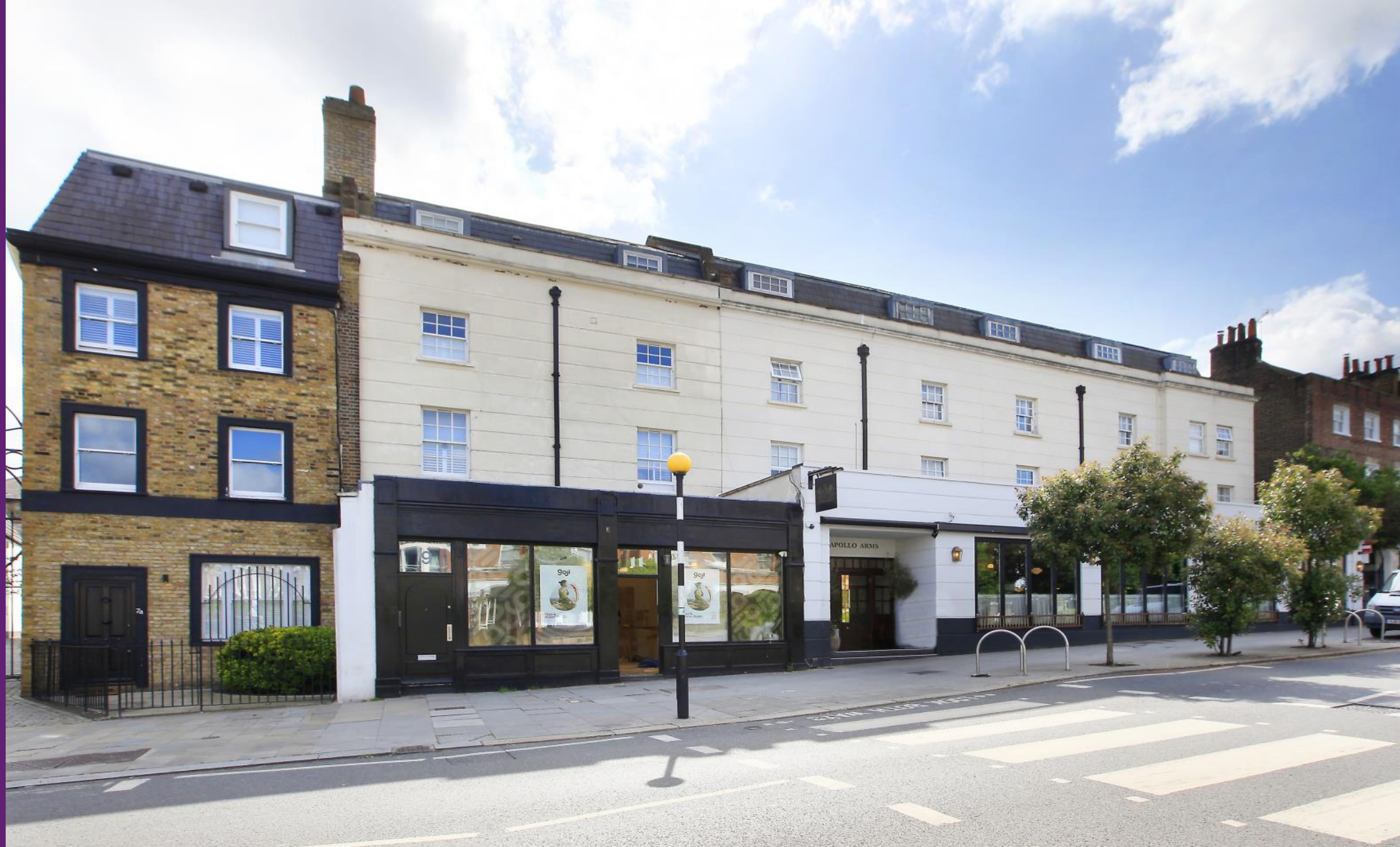
Old Town Clapham, SW4