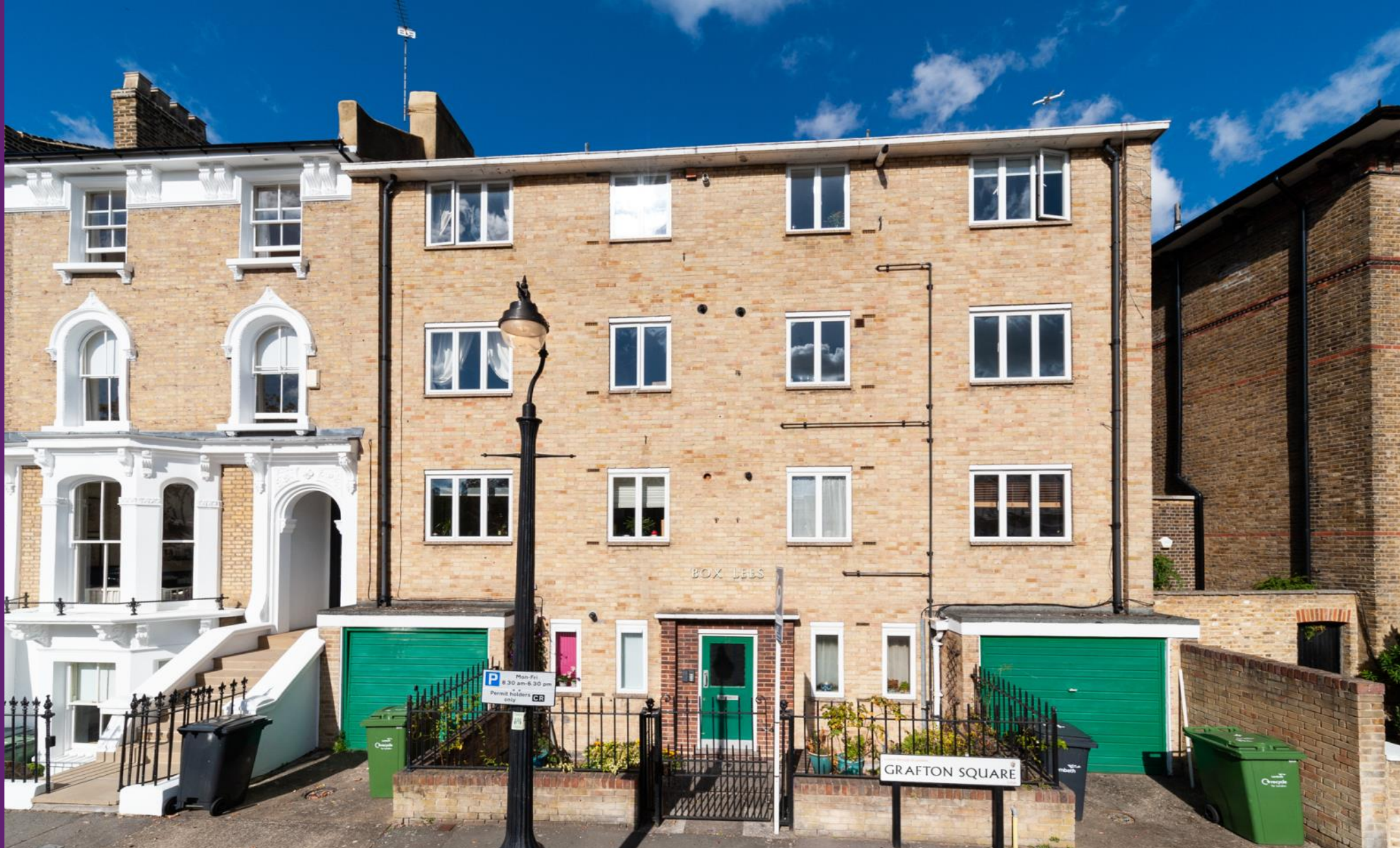
Grafton Square Clapham, SW4