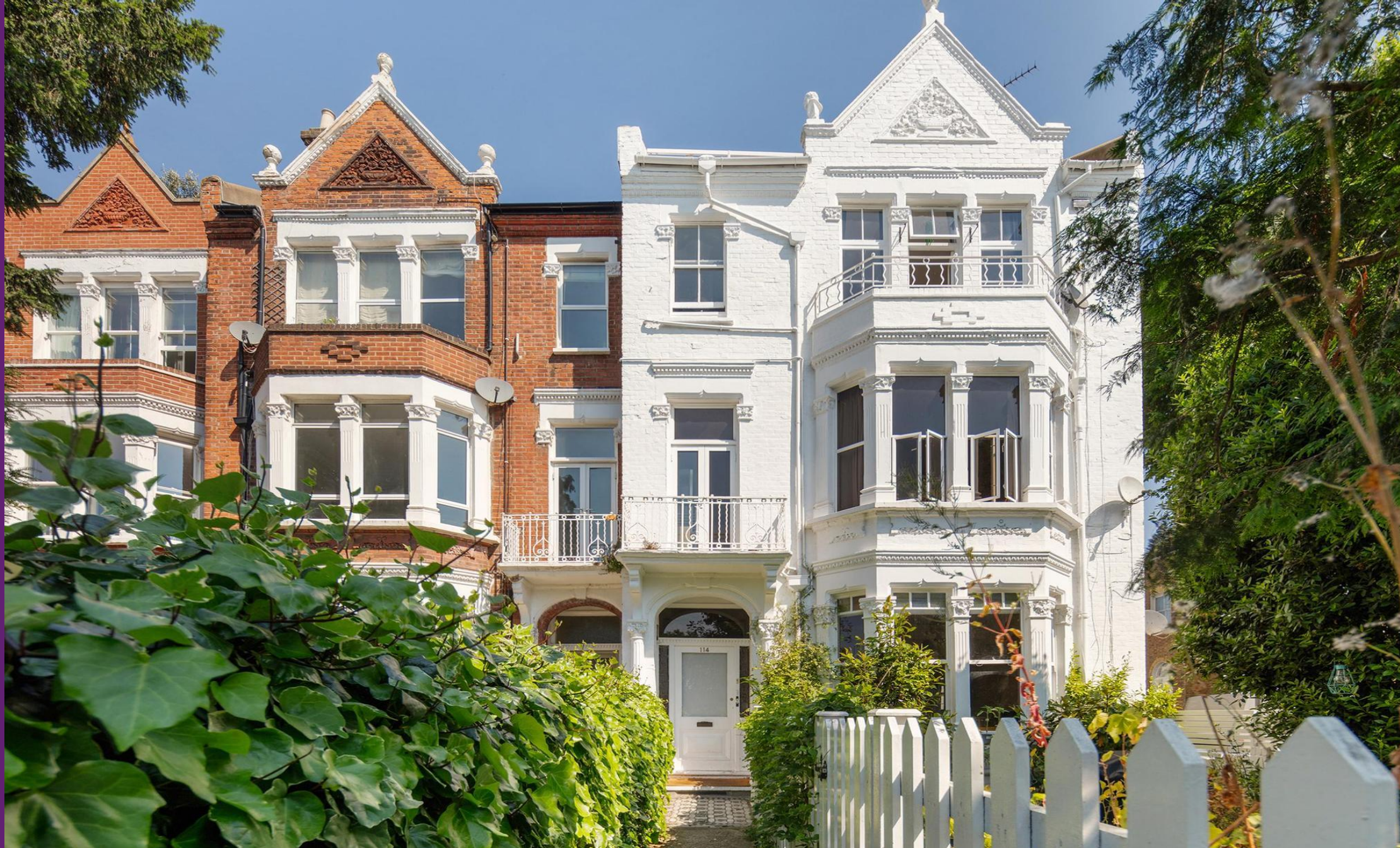
Clapham Common North Side London, SW4