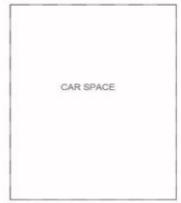
First Floor 784 ft 2

The Shrubby, SW11 Approximate Gross Internal Area 72.80 SQ.M / 784 SQ.FT