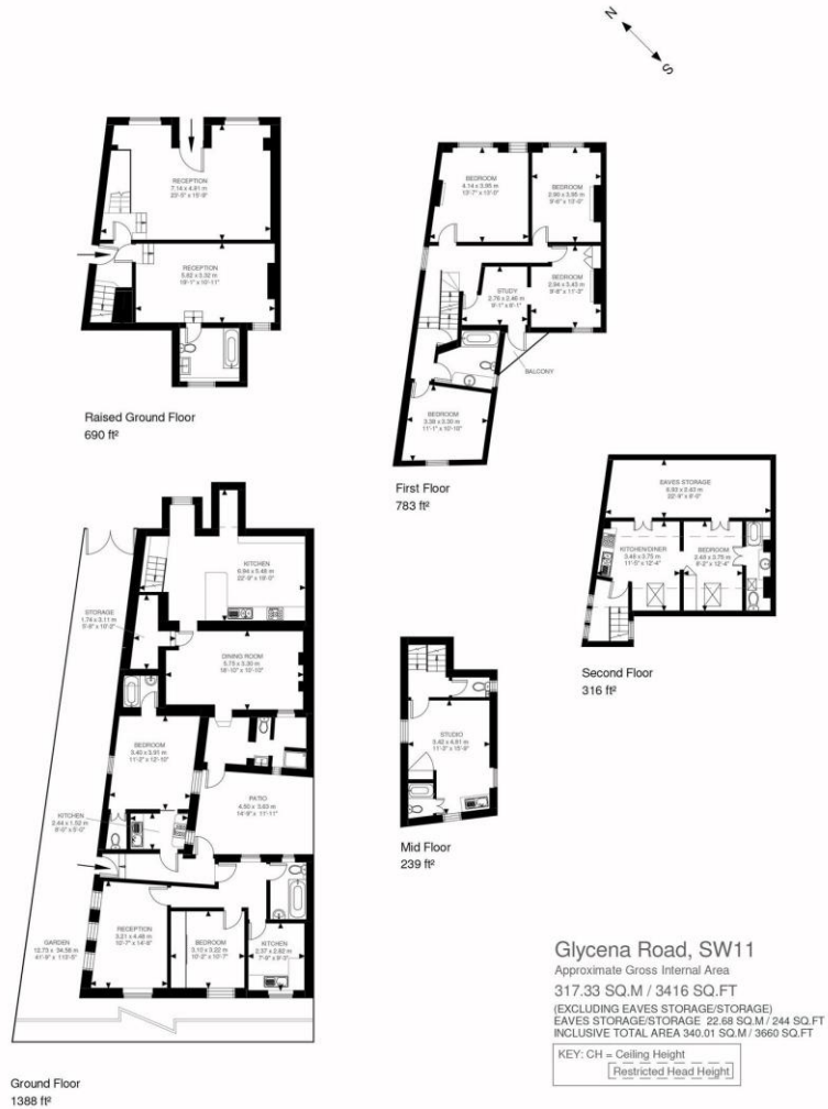
Illustration for identification purposes only. Not to scale. Floor Plan Drawn According To RICS Guidelines.

Chesterton Global Ltd trading as Chestertons for themselves and for the vendor of this property whose agents they are, give notice that (i) these particulars do not constitute any part of an offer or contract, (ii) all statements contained within these particulars are made without responsibility on the part of Chestertons or the vendor, (iii) whilst made in good faith, none of the statements contained within these particulars are to be relied upon as a statement or representation of fact, (iv) any intending purchasers must satisfy themselves by inspection or otherwise as to the correctness of each of the statements contained within these particulars, (v) the vendor does not make or give either Chestertons or any person in their employment any authority to make or give representation or warranty whatsoever in relation to this property. Wide angle lenses may be used. ©Copyright Chestertons | Chesterton Global Ltd | Registered Office 40 Connaught Street, Hyde Park, London W2 2AB Registered Company Number 05334580.