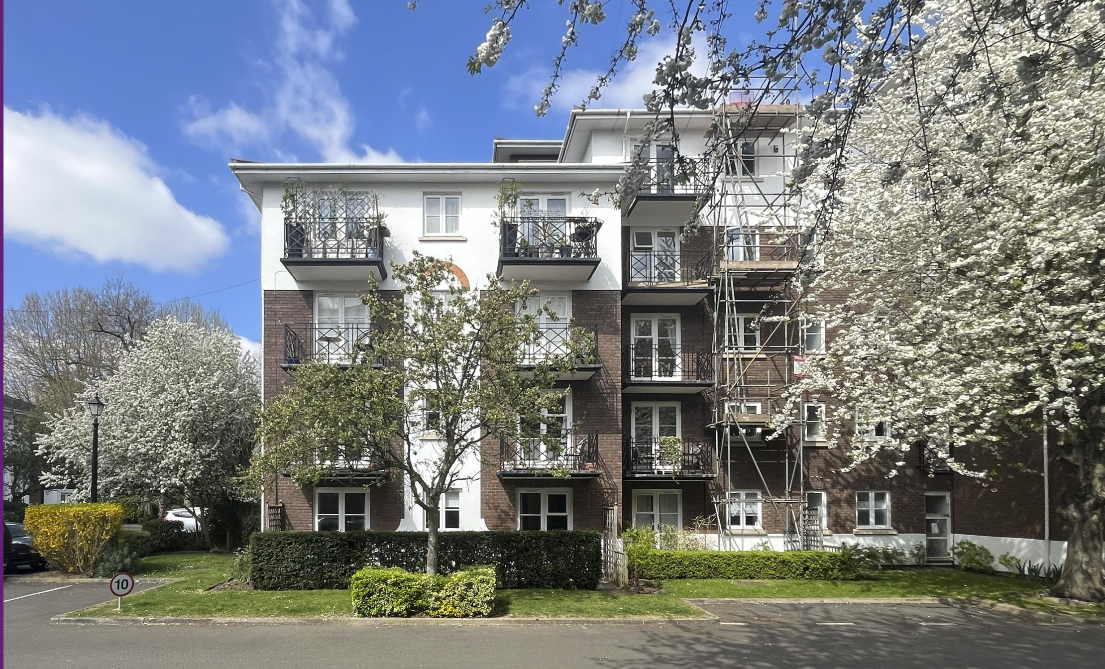
Brompton Park Crescent London, SW6