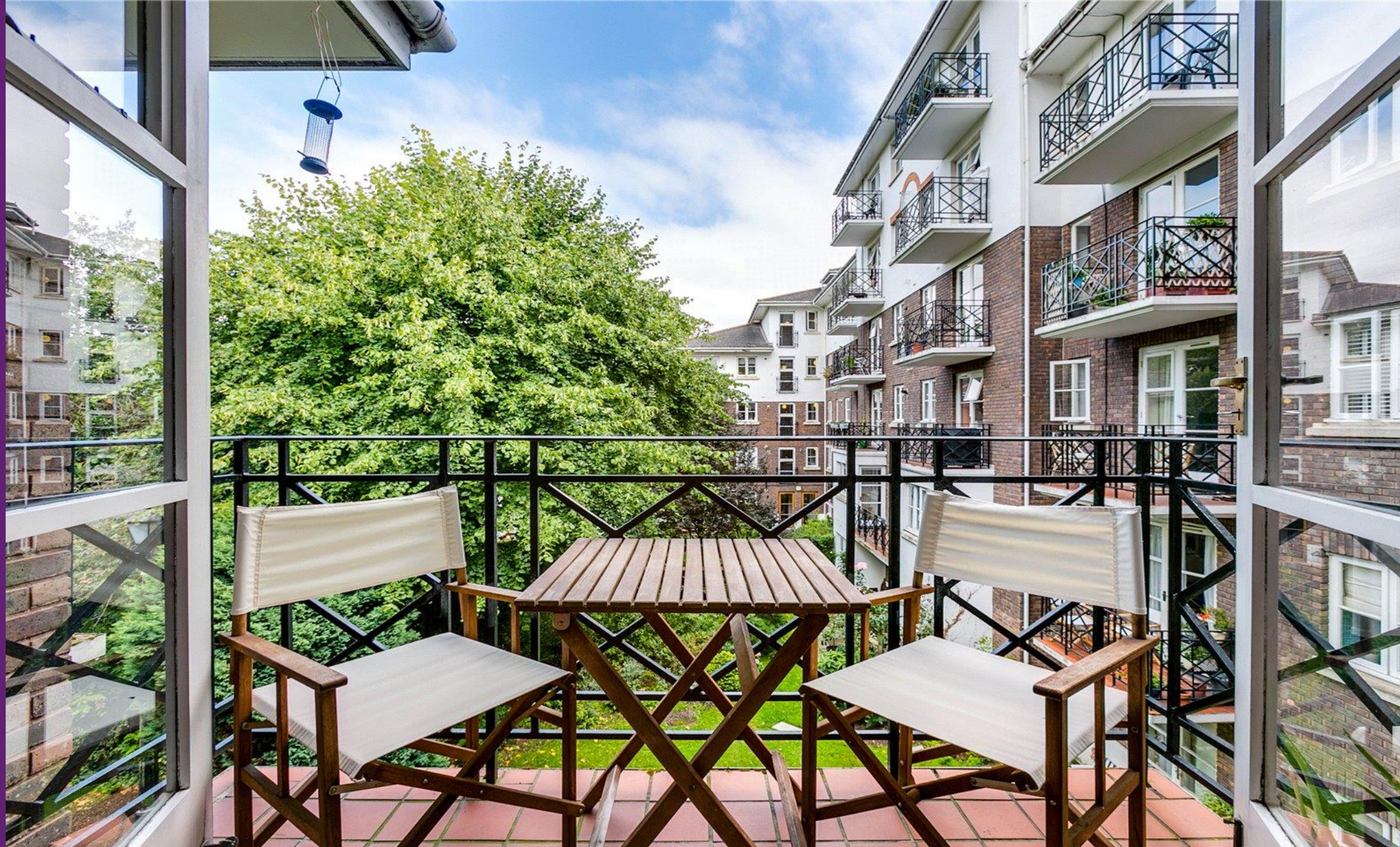
Brompton Park Crescent Seagrave Road, SW6