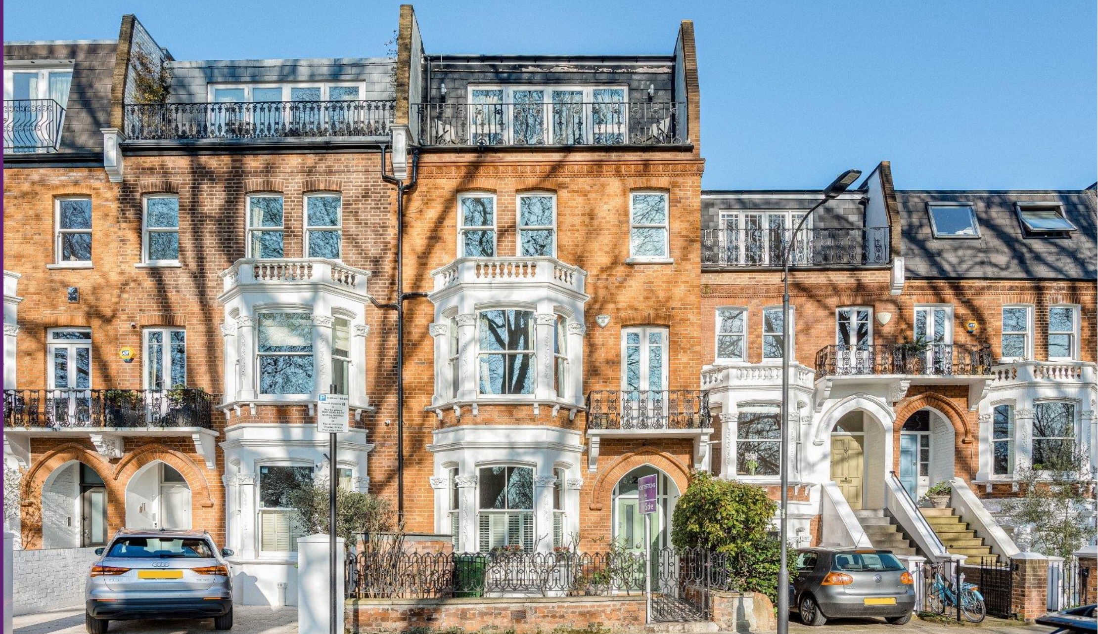
Musgrave Crescent Eel Brook Common, SW6