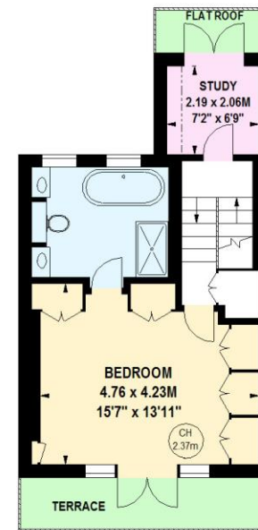
445 sq ft Third Floor

This floor plan is a representation for guidance purposes only, not for valuation. Any figure is approximate and must not be relied on as a statement of fact. Copyright of Wyatt Dixon Homes