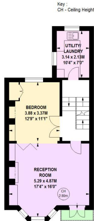
560 sq ft First Floor