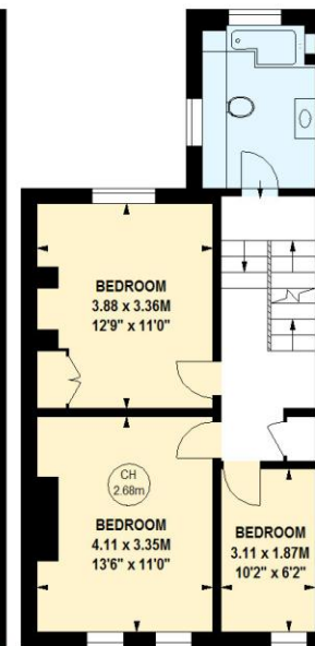
544 sq ft Second Floor