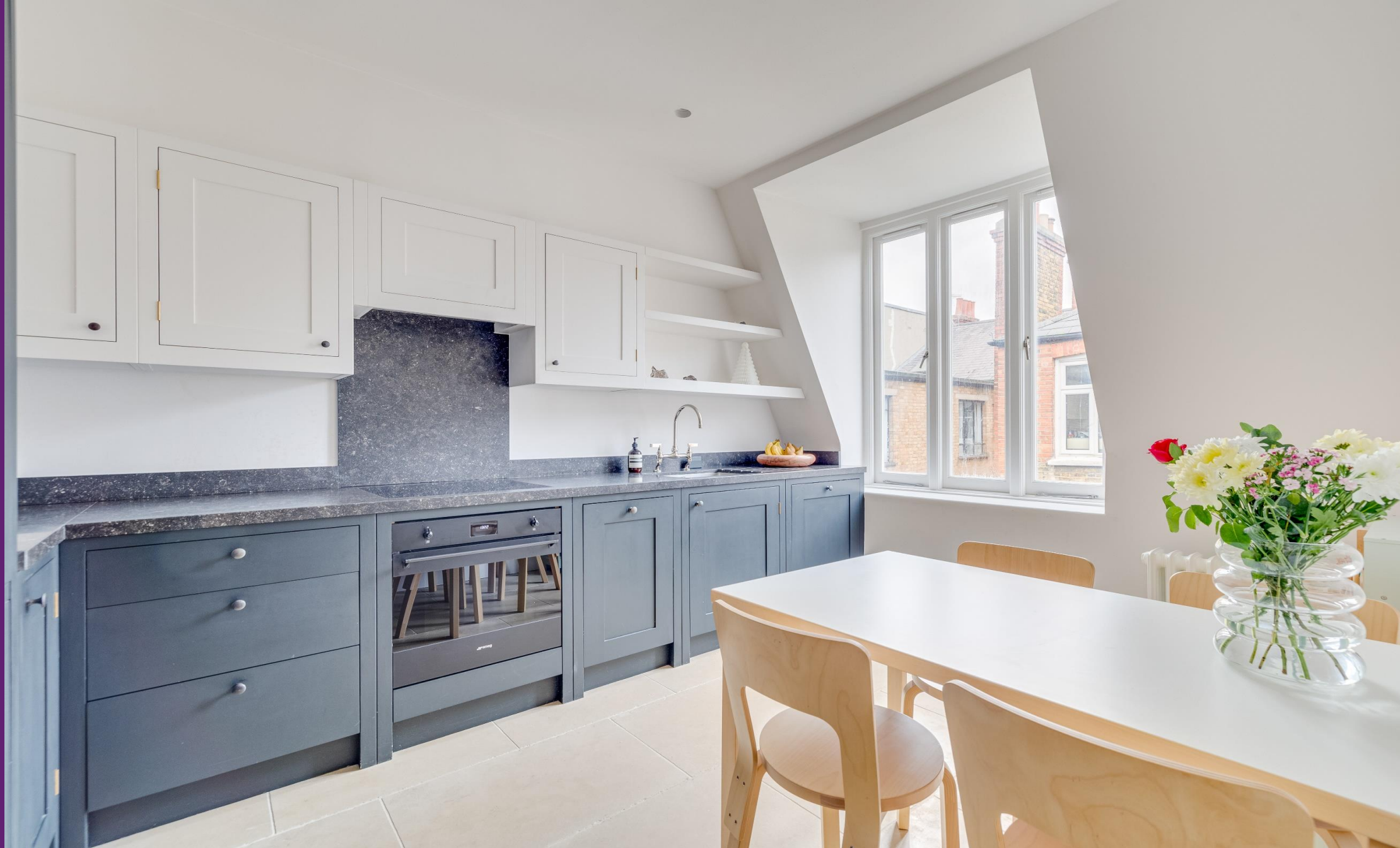
Fulham Park Gardens Fulham, SW6