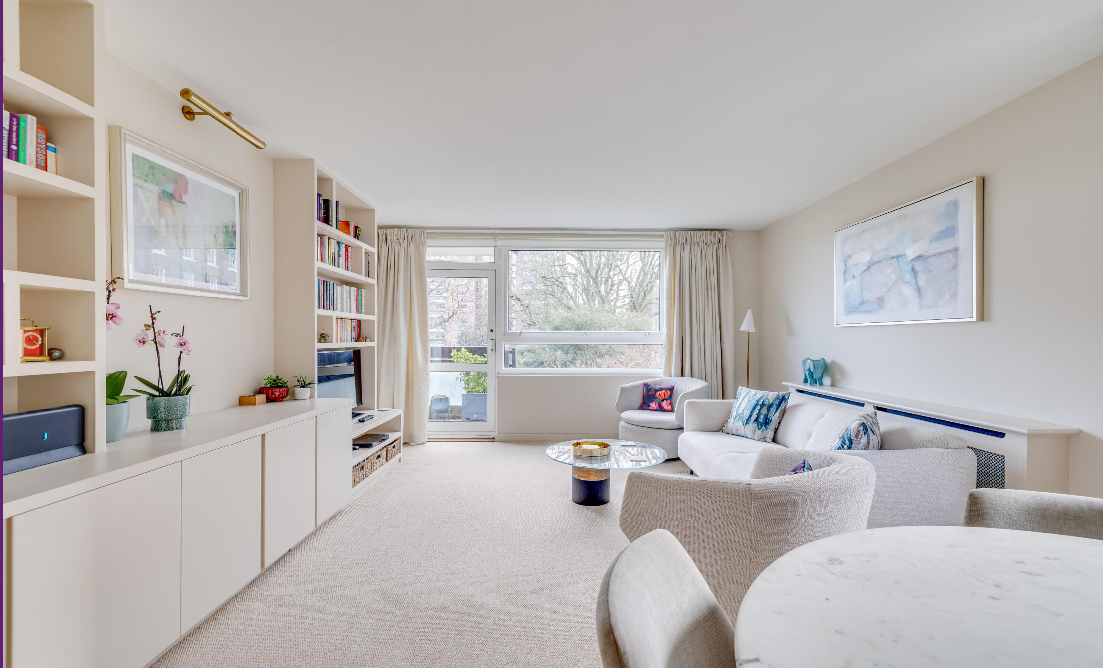
Napier Court Ranelagh Gardens, SW6