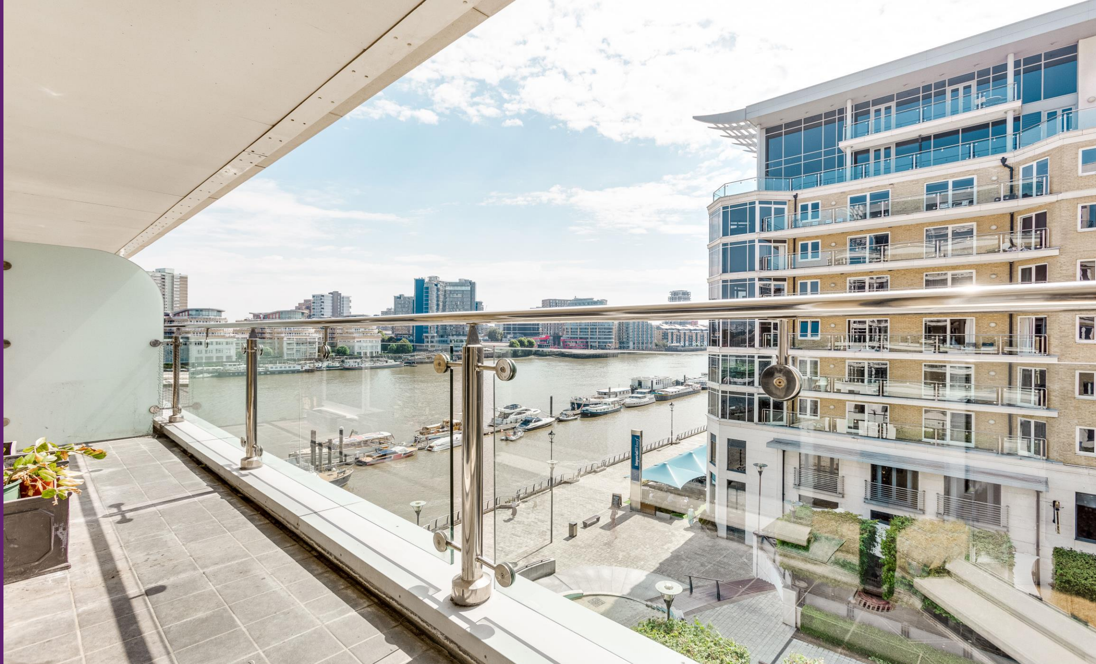
Waterside Tower The Boulevard, SW6